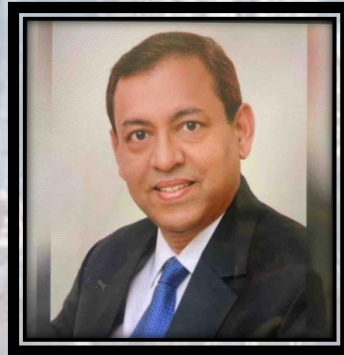
Shri Rajeev Nivatkar Hon. Commissioner Medical Education and Research